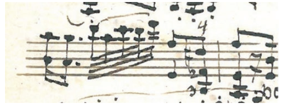
3 Götzt, Galanterie no.18, bar 19: scordatura notation (Prague, Národní Muzeum, Ms. XLIV-A-440, fol.14)

Götzt and Fuchs provide a considerable number of fingering suggestions for the performer, offering a valuable insight into interpretative choices and instrumental technique in the late 18th century. Götzt seems consistently averse to ‘barring’ the fingers across the strings when such an approach would technically be feasible (see illus.3, which shows the original scordatura notation, and the transcription in ex.8). Instead, he often calls for different fingers to be placed extremely close to one another. Many players today would find this approach risky, since the fingers are bunched up together in a way that many find uncomfortable and unreliable. Götzt’s approach becomes more understandable if we keep in mind that he was using gut strings, which go out